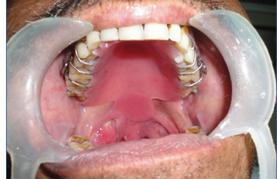
[Table/Fig-4]: Photomicrograph showing small, medium and large sized lymphocytes cells along with tissue necrosis. (H&E, 45X). [Table/Fig-5]: Image showing fabricated obturator over the patient's maxillary cast. [Table/Fig-6]: Image showing try-in of the obturator in patient's mouth. (Images left to right)

and lethal course [2]. According to literature, the majority of lethal midline granulomas are nasal NK/T cell lymphomas [3], and they are very aggressive, locally destructive, midfacial necrotizing lesions. Many of these were diagnosed as LMG initially, a term that is slowly being replaced. Main challenge in diagnosing these conditions is because of non specific symptoms the patient presents with, which also delays the management. Multidrug chemotherapy followed by radiotherapy appears to be the most effective treatment approach in most of the cases [4].